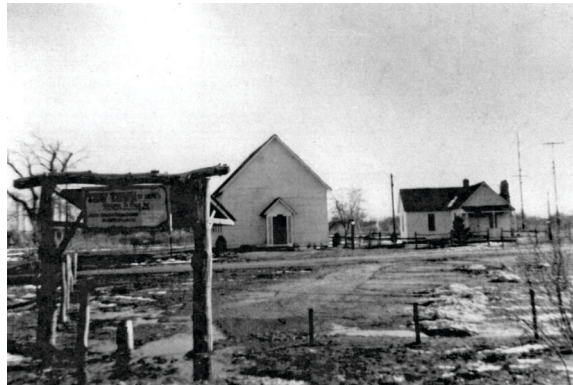
This photo from the 1950's shows Old Cowtown's first entrance. At the official opening Old Cowtown's original name was "Cow-Town of 1872".

You can get information on any of the above events by going to Old Cowtown's Facebook page and/or visit www.oldcowtown.org . Member Free Admission does not apply to events marked with*.