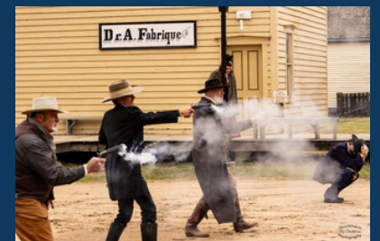
more shots of Season Launch with the River City Renegades