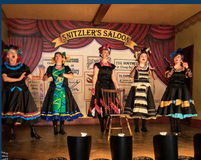
Daisies kickin' off the Season Launch

Need to speak to us.... BOARD@HISTORICWICHITACOWTOWN.org